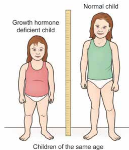
Figure 2. Stunted Growth in Children with Growth Hormone Deficiency

The consequences of growth hormone deficiency vary depending on the age when it occurs. Babies lacking growth hormone may develop hypoglycemia (low blood sugar). Children and adolescents with growth hormone deficiency grow more slowly than normal and, if left untreated, become unusually short as adults (Figure 2). They also have more body fat, especially around the waistline, and may not achieve normal bone density and strength.